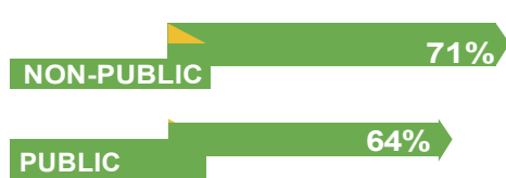
2017-18 Schools receiving an A or B grade